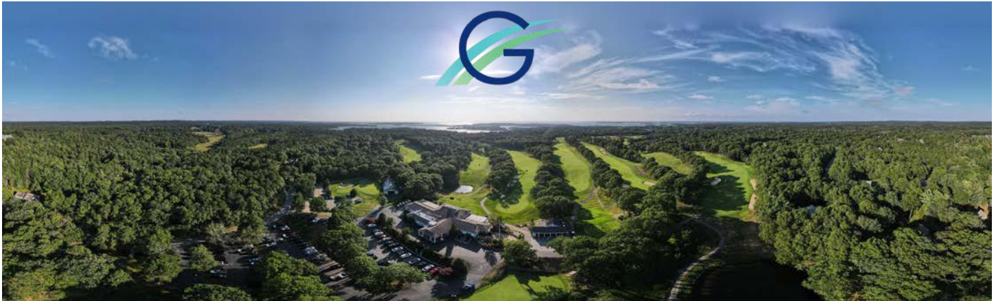
A picture-perfect day for Gosnold's 22nd Annual Charity Golf Tournament at the Pocasset Golf Club on August 30, 2021.