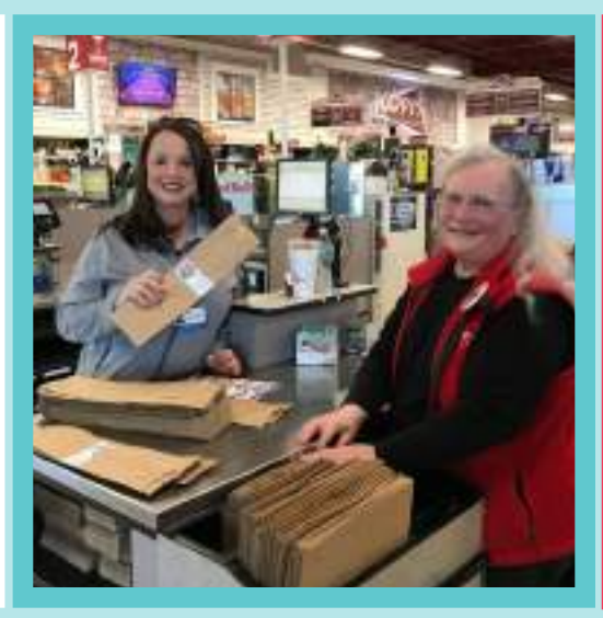
Gosnold staff and volunteers particpate in Gosnold's annual Sticker Shock Campaign, raising awareness of under age alcohol sales & consumption; held at various liquor stores across Cape Cod.