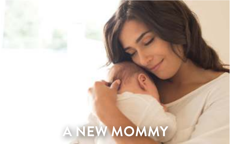
A NEW MOMMY