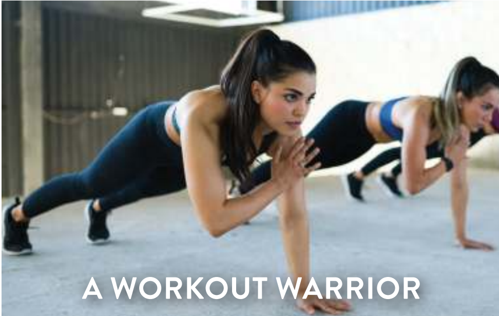
A WORKOUT WARRIOR