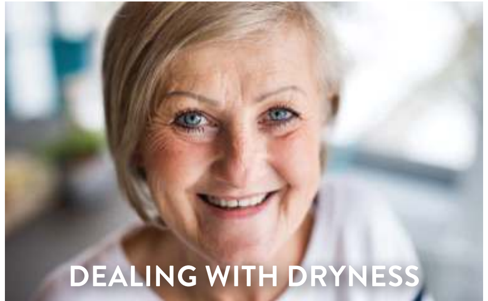
DEALING WITH DRYNESS