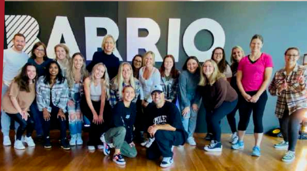
Artisan Dental having Team Building Day at Barrio in 2022