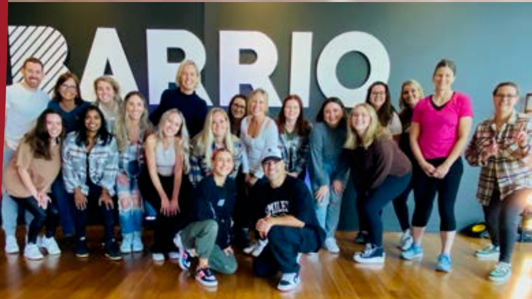
Artisan Dental having Team Building Day at Barrio in 2022